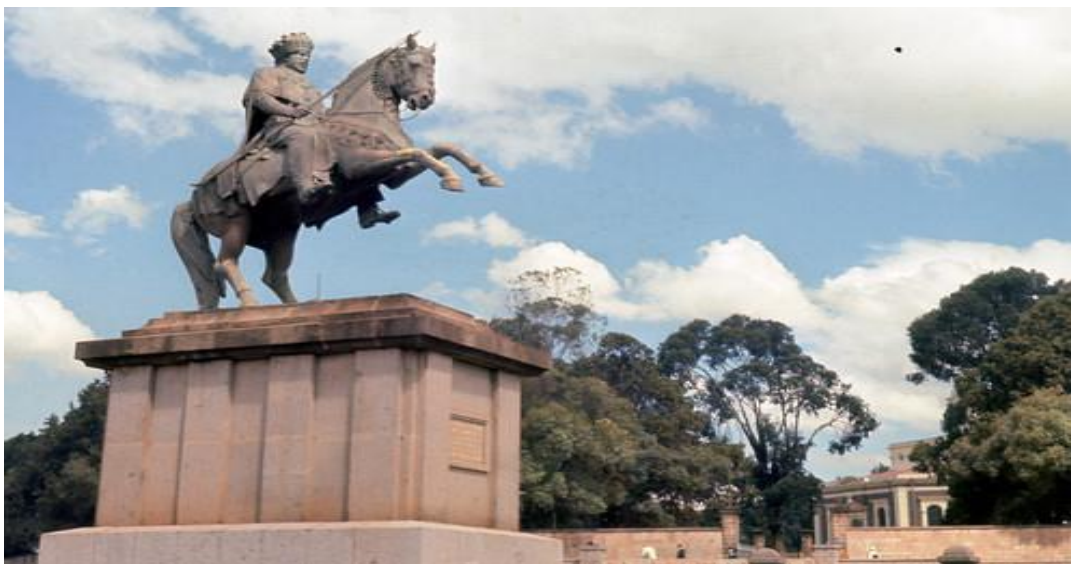
Figure 2 An Equestrian Statue of Emperor Menelik II.