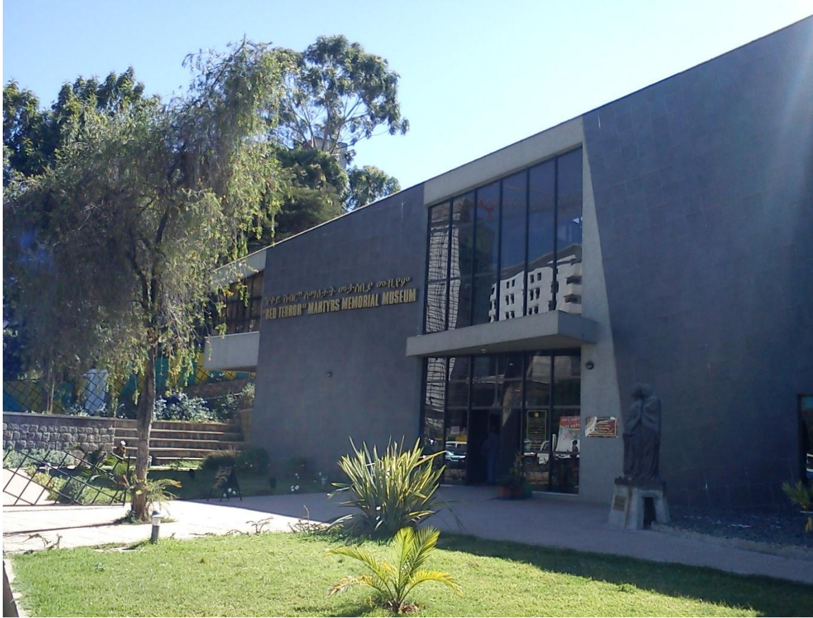
Figure 3 Red Terror Museum

It is inside a mediocre building and can go almost unnoticed as one walks or drives to the Bole Airport. At the gate, there is a monument of a woman with two daughters with an under caption “Never, ever Again” it is to mean that “An egregious atrocity and crime against humanity will never, ever again be repeated in our beloved country Ethiopia or on our planet for that matter”. The martyrs willingly gave their life for what they believed in, and discretion for them was never the better part of valour, as some in the spirit of Falstaff would decry. It was the ultimate price they paid for the freedom of their fellow citizens. Those were heroes ready to repeat the same sacrifice as long as oppression and subjugation prevails. “Red Terror” is the natural response of a derelict fascist government to a genuine and honest uprising of oppressed people.