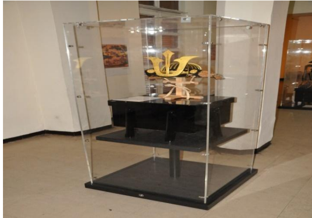
Fig: 4.6 Ethnography Exhibition of Japan’s Embassy (ARCCCH Audio visual section, 2014)

people to people tie. The temporary exhibition is used to tie the two countries people to people in bilateral relation, cultural exchange and image building (Neves, 2002). Hence, regarding this the temporary exhibition at the “NME” played a great role. The researcher concludes that, the temporary exhibition at the “NME” is giving more time and service for the outsider.