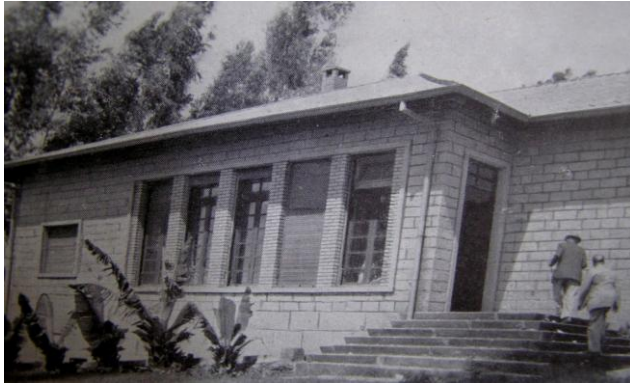
Fig.1.2 (The first museum building “NME”, 2001)

This exhibition endeavor inspired the Emperor to generously dedicate the current “NME” premises at Amist kilo, as shown in figure 1.4. The Third Permanent Exhibition was organized in the historical building, which was built for the residence of the fascist Italian viceroy in Addis Ababa in 1935.