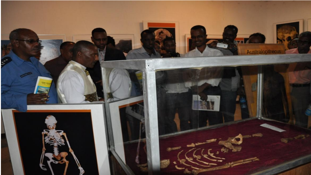
Fig: 4.4 Travel Exhibition held in Dire Dawa Town (ARCCH Audio visual section, 2010)

The significance of organizing of temporary exhibition is to raise awareness, to provide education and it is one means to make accessible the education service of the “NME” for people who are living in different corners of the nation. Similarly, it has the purpose to increase the value of the heritage and to give informal education for school children (Claire, 2015; Osborn, 1953). The travelling exhibition of the “NME” also goes along with the experience abroad.