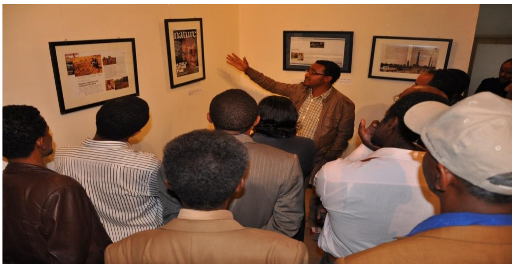
Fig.4.5 Temporary exhibition organized by ARCCH (ARCCH Audio visual section, 2013)

The study has shown that, since 2012 till 2015 ARCCH organized nine temporary exhibitions within different theme as indicated in Appendix 12 and figure 4.5. As compared to the group and individual exhibitors it is two to three times in a year. But, in the ARCCH collections store over one million nations and nationalities collections were collected which do not exhibit in the permanent exhibition. Temporary exhibition could be organized to familiarize those nations and nationalities objects (Neves, 2002) that should be displayed for the “general public” in order to represent the nations object in the “NME”. Therefore, from the above information, the researcher can conclude that the temporary exhibition that is held at the “NME” is not playing its role properly to satisfy the need and the interest of the “general public” and the stated mission of the museum.