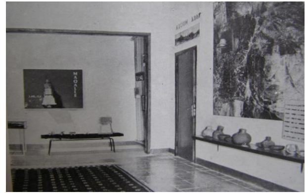
Fig1.3 (The second museum building “NME”, 2001)

The third Permanent Exhibition organized in the historical building used as the residence of the fascist Italia viceroy which subsequently remained as a museum over 40 years, until 2000. The current permanent exhibition was organized in 2000, and the old permanent exhibition was reorganized in this new building designed for this purpose (Mahlet, 2012; Merkeb, 2007).