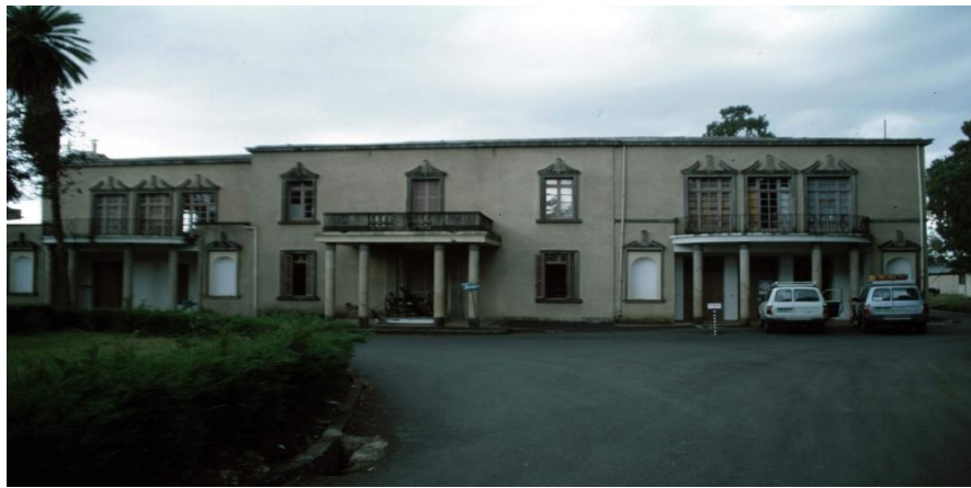
Fig.4.1 The old building of the Temporary Exhibition of the "NME", 1995)