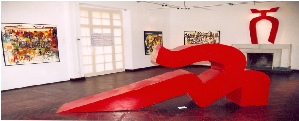
Fig.4.3 Temporary Exhibition by Wosene Kosrof (ARCCH, Audio visual section, 2011)