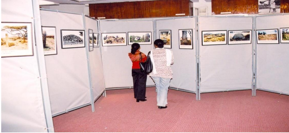
Fig.4.2 Temporary exhibition organized in the ethnographic section of the permanent exhibition (ARCCH audio visual section, 2010)