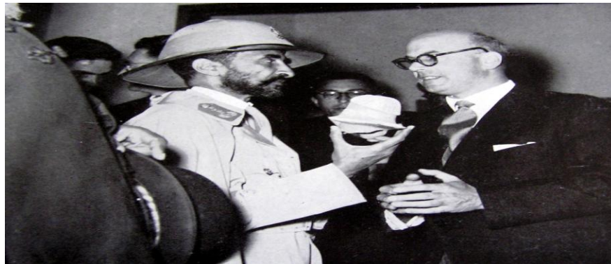
Fig.1.1 (The first archeological display “NME”, 2001).

It was during the Emperor era that royal objects and Aksumite artifacts that was displayed for the first time as a permanent exhibition in the main hall of the National Library and Archive, as shown in Figure1.2. The second permanent exhibition of the “NME” was organized in collaboration with the International Quaternary Conference of Addis Ababa in 1971/2in what is now the Commercial Bank club of Ethiopia as shown below in Figure1.3 (Tekletsadik, 1959).