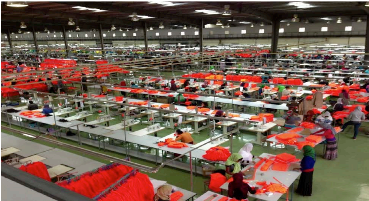
Female Workers working on production Lines