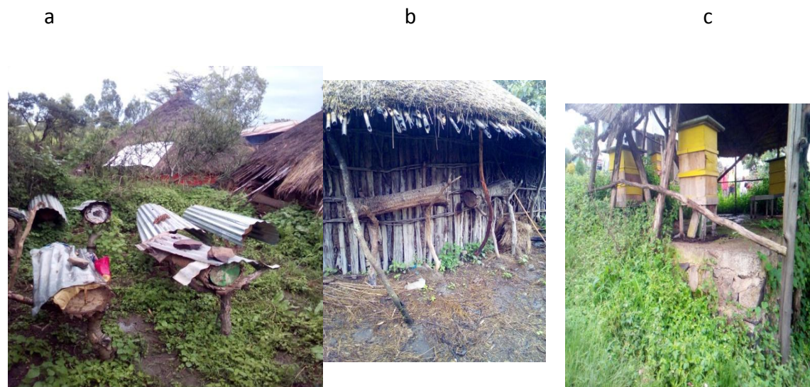
Figure 3: Bee hive placements a. Back yard b. Under the eaves c. Inside a shelter