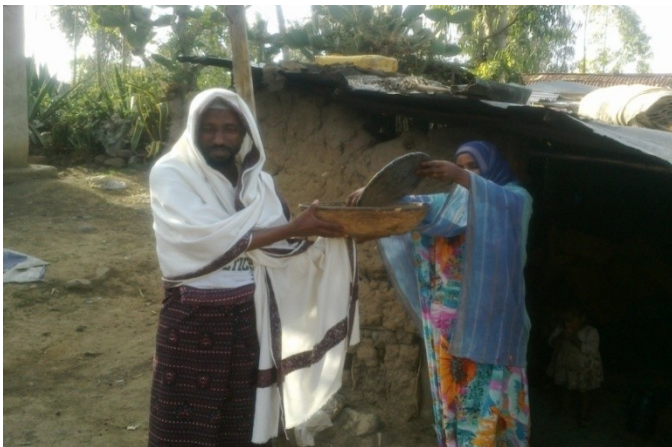
Student in Qaria