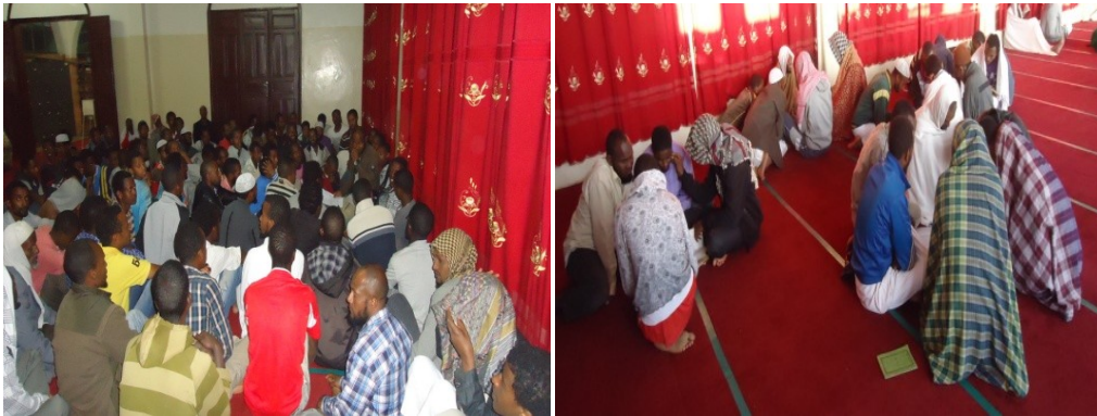
Students in multi-grade class room

According to MOE (2002:9) accessibility of school services was extremely inequitable; huge gap existed among regions, genders and above all between urban and rural areas in Ethiopia. In the rural areas where the overwhelming majority of the populations are living, there was hardly any budget for elementary schools. However, for MOE (1994) article 3.9.4 of the education and training policy it was promised that “special financial assistance will be given to those who have been deprived of educational opportunities, and steps will be taken to raise the educational participation of the deprived regions.” So that, in order to the government fulfill its promise basic education at least can be expanded with the aid of economical and simple educational practice – multi grade education.