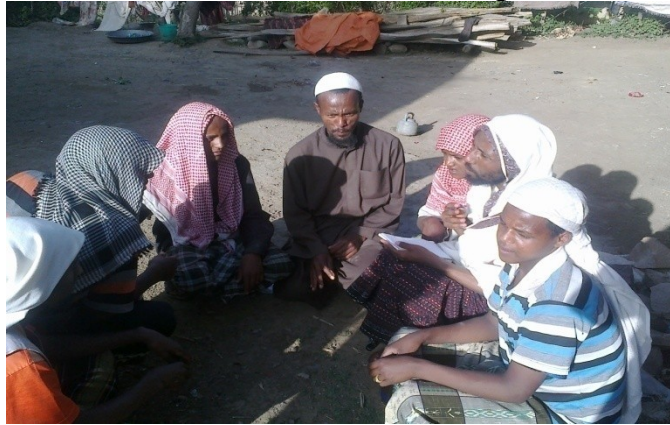
Focus group discussion