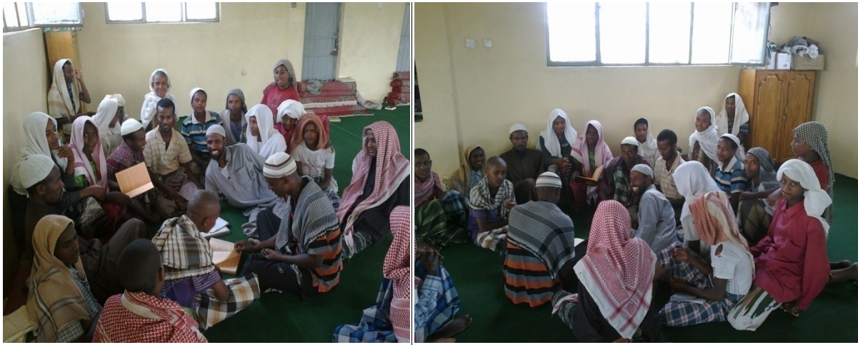
Discussion with students

leading religious ceremonies to offering traditional medication. The detail discussion of some of the daily routines are discussed here under.