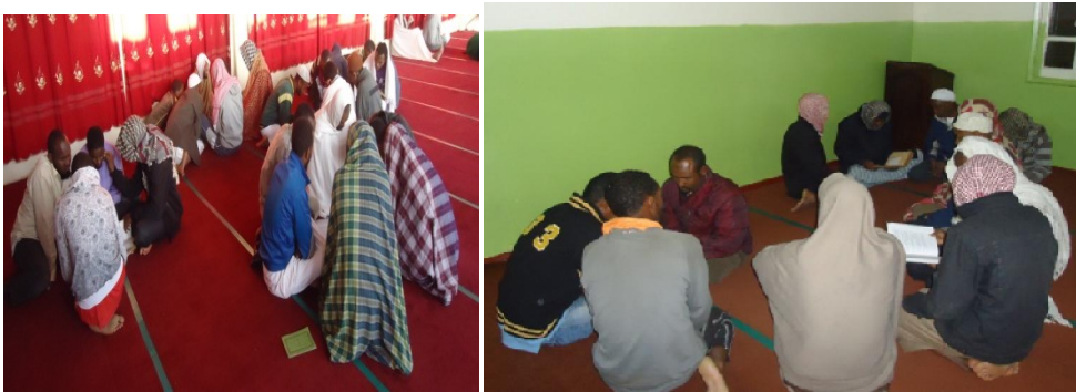
Students in Mutalla'a (group discussion in the Mosque and in the Sheikh home)