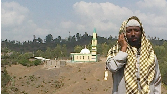
The mosque and the school with the writer