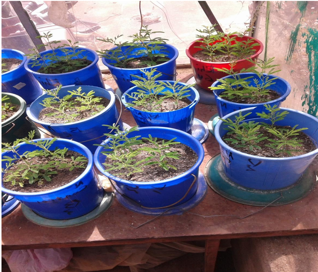
Fig.1. Acacia seedlings in AAU under greenhouse