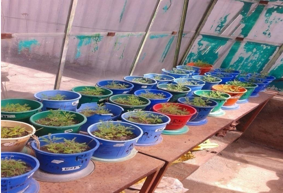
Fig.3. The inoculated, the N + and N - control groups under the greenhouse