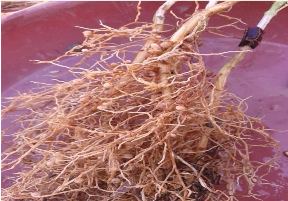
Fig.2. Nodules induced by isolates; AURAneg31