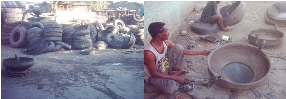
Plate 6: old tires recycling in Adama

Among respondents, 13 households (8 %) compost or reuse food and vegetable wastes for soil enrichment for their gardens and horticultures. Cans, bottles and other packaging materials are being reused by 52 households (32.1 %) and 32 households (19.8%) reuse paper, wood, plastic and yard trimmings as fuel (fire wood).