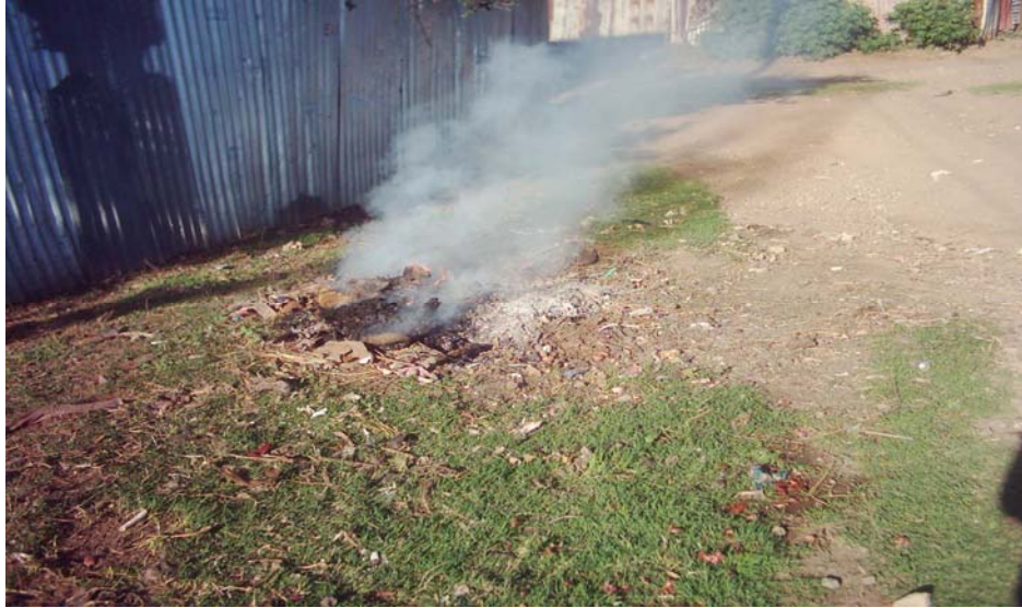
Plate 9: Household waste burning