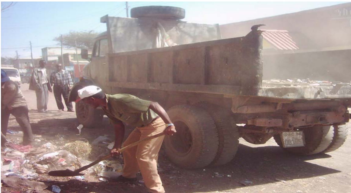
Plate 10: door- to- door waste collection, 2007

1. Door – to- Door collection: - Two trucks of capacities 7m 3 and 5m 3 (manual loading) type are assigned to collect street sweepings and wastes from households. Due to limited capacity this method of collection can not touch all corners of the town, it mainly focuses on at center kebeles and congested areas. To cover large areas the municipality uses shift round. The trucks collect wastes and transport to the disposal site, in doing so a truck is expected to cover four trips a day. However, due to technical and other constraints these two trucks cover less than eight trips a day. Plate 10 shows when a truck collecting street sweeper and plate11 when a multi-loader picking a container from a storage site.