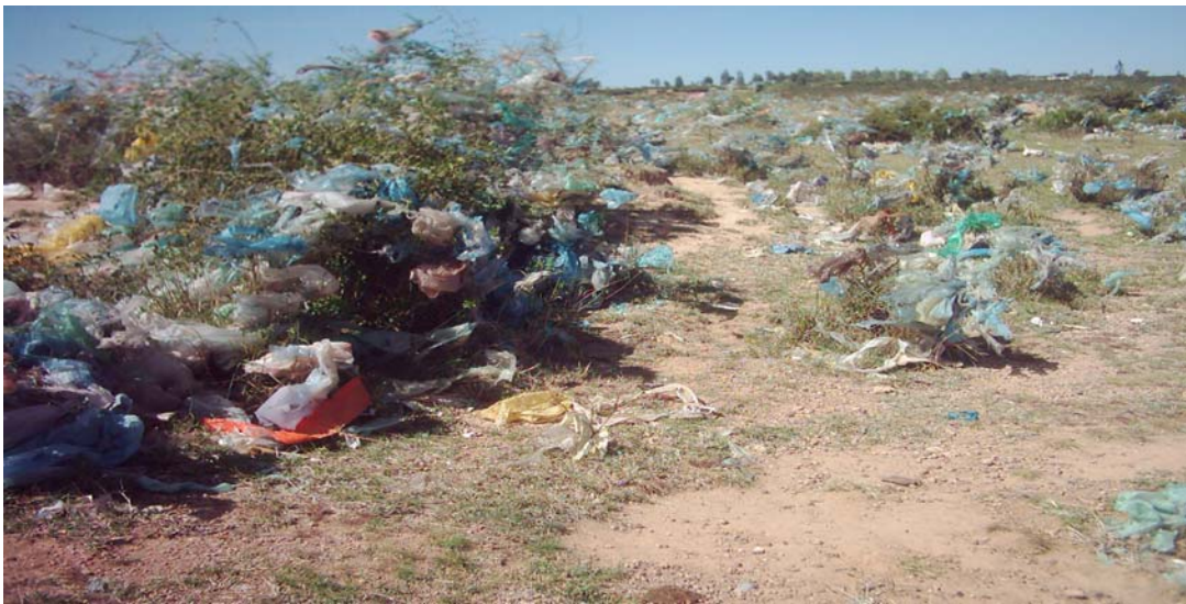
Plate5: plastic wastes disseminated around disposal site

Next to food waste, plastic waste is the second in that it was contributed from 122 (75.3%) of the households. Although its magnitude was less, plastic waste is a common problem of more than three-fourth of the households. Plastic wastes constitute 2.1 % by weight and 5.8 % by volume of the total waste generated. Due to its non-decomposability and easily movable by wind plastic wastes are found everywhere. Particularly the final disposal site and its surroundings are being polluted by 'festal' (Plate 5).