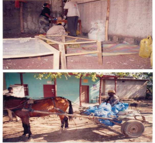
Plate4: Wire mesh and Horse-drawn cart