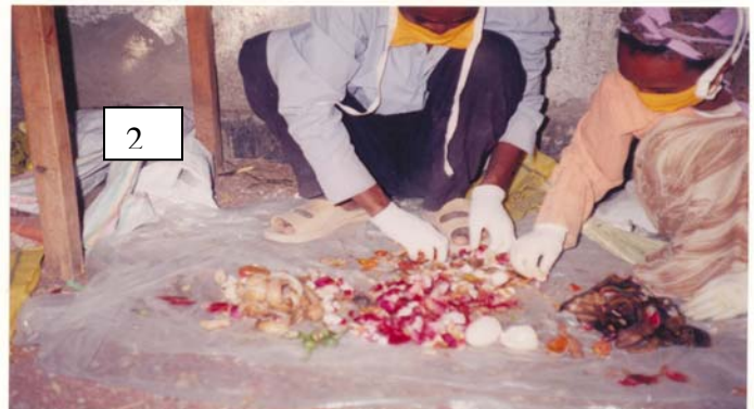
Plates 1 and 2: Sorting and measuring wastes