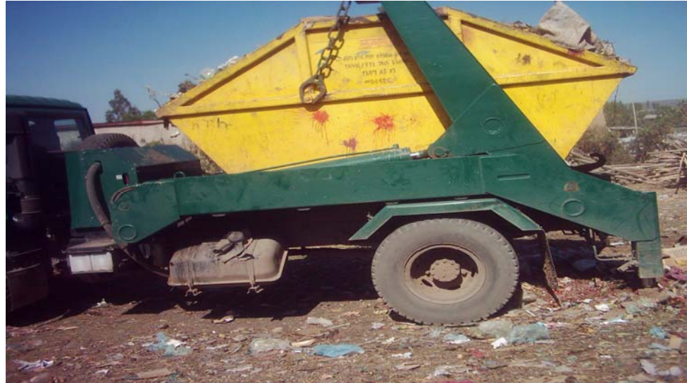
Plate 11: Block and container collection system, 2007

2. The second and third types are container systems; there are 24 containers of capacity 7\text{m}^3 and 8\text{m}^3 distributed at different areas. Some of these containers (17) are cited at different kebeles to serve households and any residents. The other 7 are distributed to public firms like hospital, university, bus station etc. To collect and dispose wastes from these containers two multi – loader trucks of capacity 7\text{m}^3 and 8\text{m}^3 are assigned. A truck is intended to cover 8 trips in a day, again due to technical and others it covers less than this.