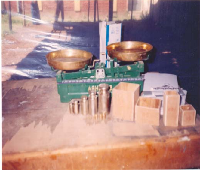
Plate 3: Beam balance and Wood buckets